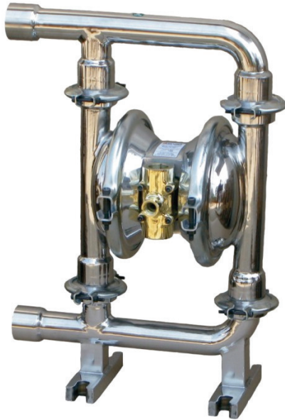
Model No.: DP25SST